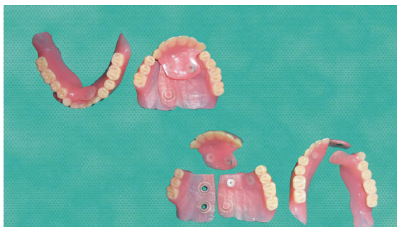
[Table/Fig-6]: Maxillary and mandibular sectional dentures